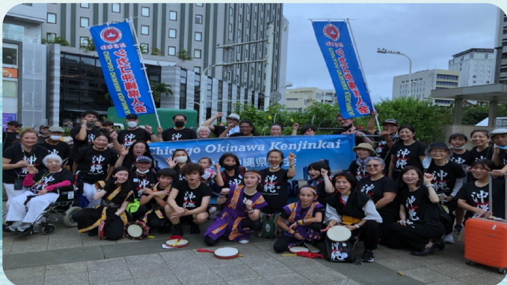
Chicago Okinawa Kenjinkai members at the Taikai parade on Kokusai dori