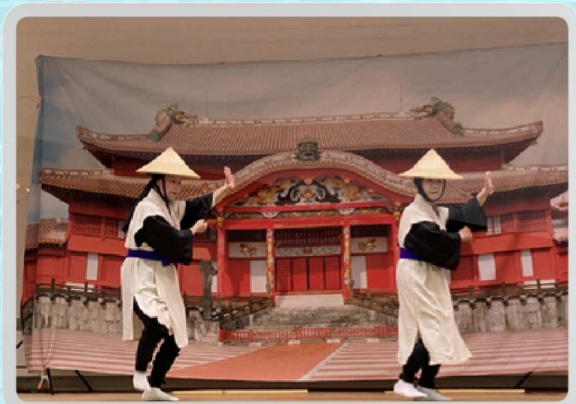
Ryubu dancers performing Kai no Hatuma