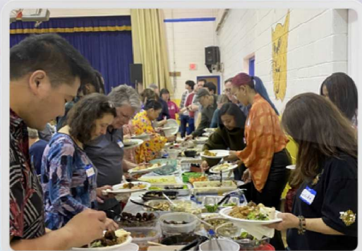
Members and guests enjoying the Spring Celebration Party in April.