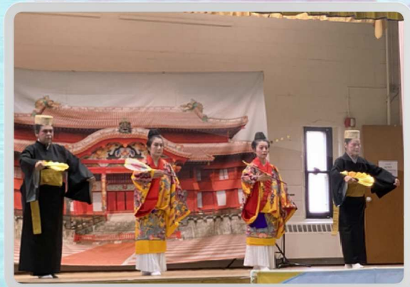
Ryubu dancers performing Kagiadefu