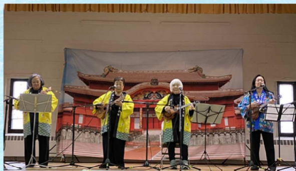
Ukulele group performers