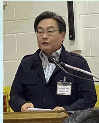
Consul General Tajima