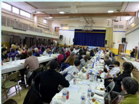
Banquet hall at St. Paul's church