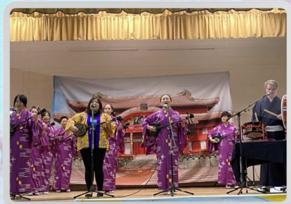
Sanshin group performing a medley of Okinawan songs