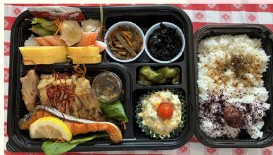
No.1 - Chicken teri/Salmon - $15

Place your orders by Wed., July 17th, 2024