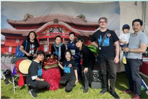
Consulate staff with the Kenjinkai performers at Skokie Festival of Cultures