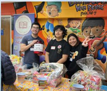
Volunteers selling raffle tickets