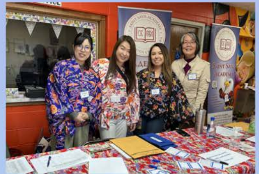
Volunteers at the registration desk