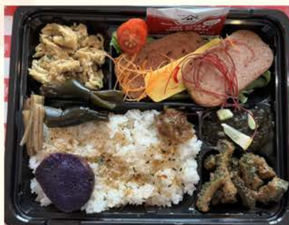
No. 2 - Okinawan bento (spam) - $10