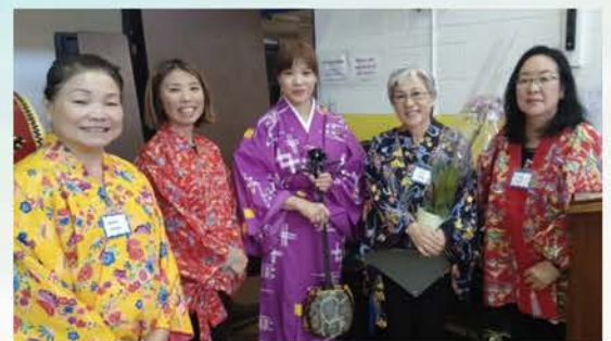
Elected kenjinkai officers