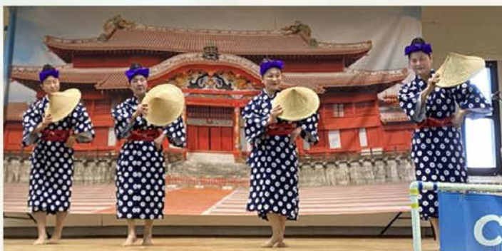
Minyo dancers performing Natsu Sugata