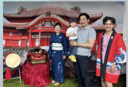
Consulate staff in front of Shuri-jo banner at Skokie Festival