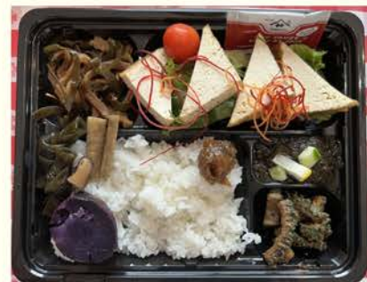
No. 3 - Okinawan bento (vegetarian) - $10