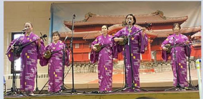
Sanshin group members performing a medley of songs