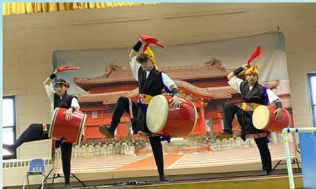
Young taiko performers performing Dynamic Ryukyu