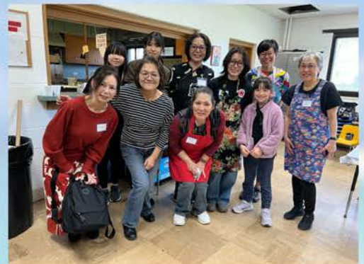
The hardworking kitchen volunteers