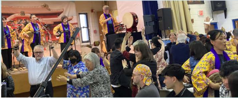
Audience dancing to the lively Kachashii music as the party drew to a close