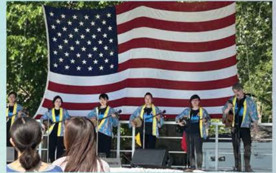
Sanshin group performing at Skokie Festival of Cultures

Our groups showcased their talents at four significant events in February and May. These photos highlight: