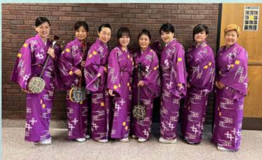
Sanshin group at the Ft Wayne IN Cherry Blossom Festival