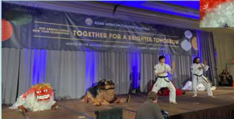
Lively performances at the 2024 Lunar Gala at the Drury Lane venue in Oak Brook